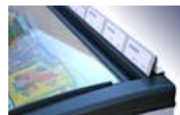
Label/ Price Sign